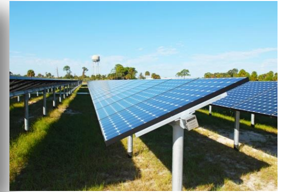
Low Carbon Energy